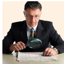
Real Estate Market Report 2016